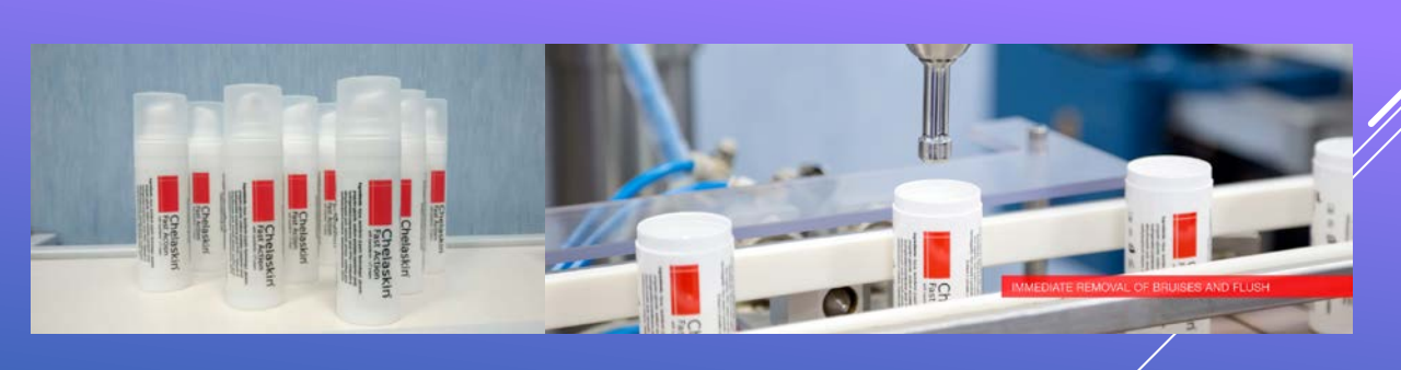
Step 4 Aftercare – Chelaskin * I-2-3 days after. Treatment 2 times.

Chelator is based on lactoferrin, which is a protein with strong antibacterial activity due to both iron-binding properties (reduces bruises) and has inflammatory action