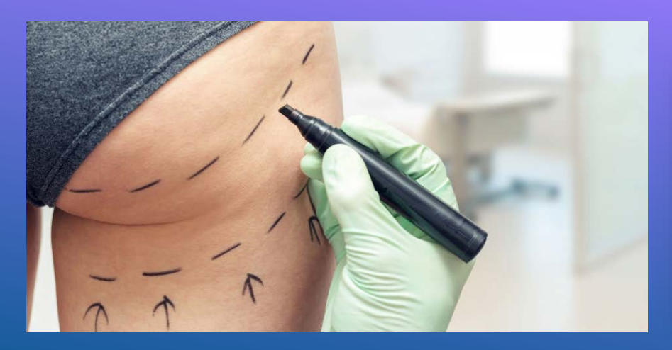
Biolisi: treatment 6-15 mm deep