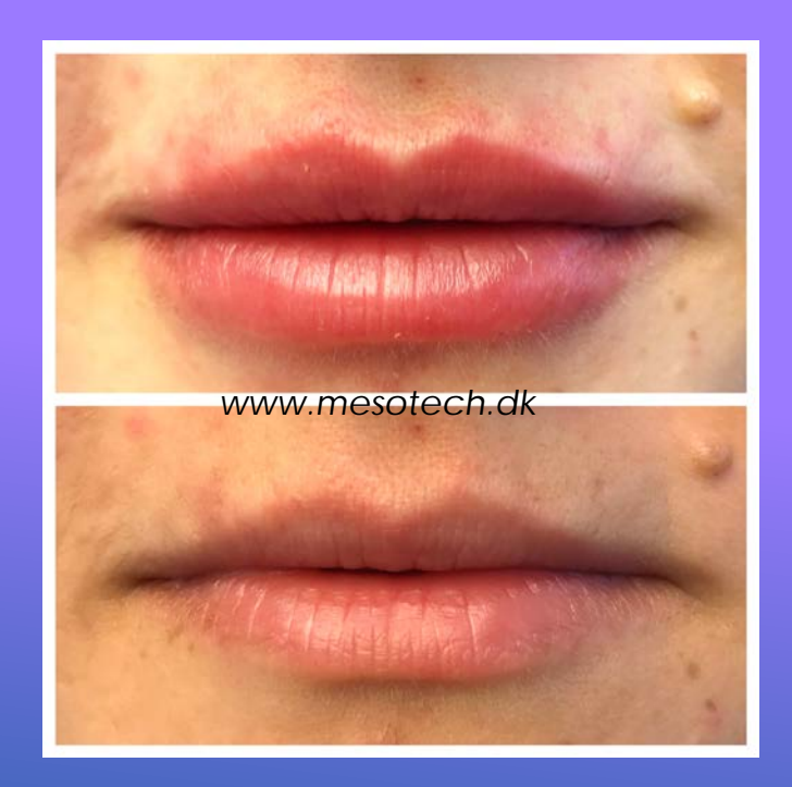
3 treatments (With injections)