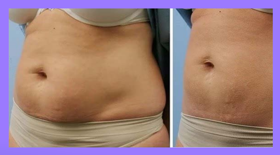
Biolisi: 6 treatments