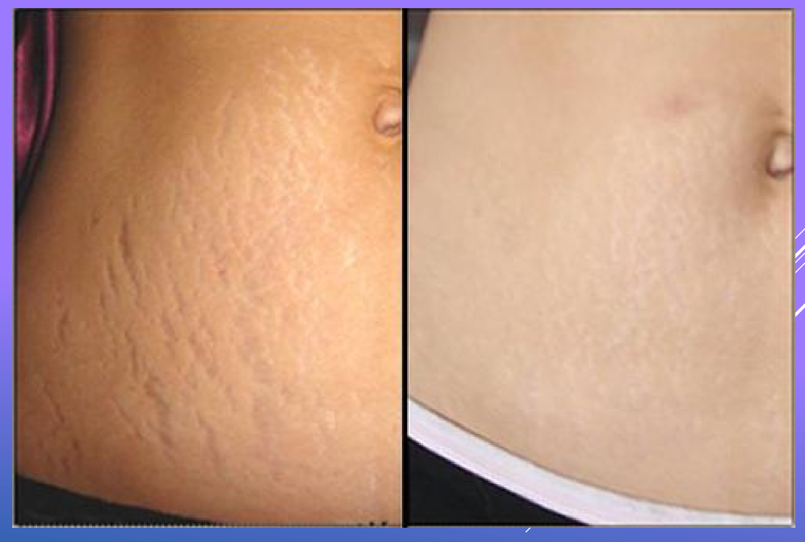
BIO STRETCH: 3 treatments at 10 days intervals

ingredients clinically proven to help prevent and repair stretch marks by increasing collagen and elastin formation, firming the collagen matrix and rehydrating targeted areas with an undetectable molecular hydrating film.