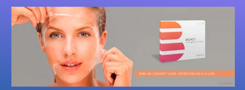
Step 3 MASK - Enhance antiaging effect and create calmness in the skin

* Biopeel is applied to the skin 12 hours before treatment your customer does it herself at home