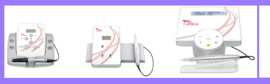
Step 2 MESO-COCKTAIL- effective treatment