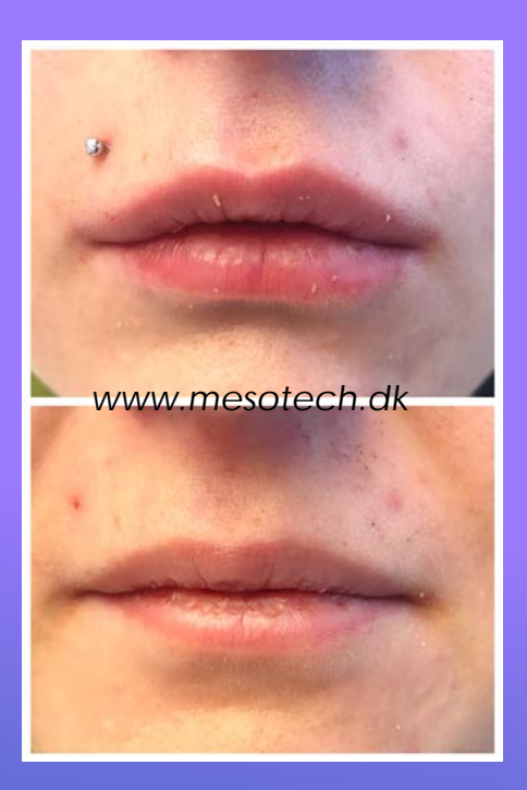
3 treatments (With injections)