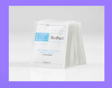
Step 1 PEEL - peeling

Derma Therapy - a non medical treatment which is performed in a non-invasive manner using derma therapy equipment from Labina (pl-500, pl-1000, pl-2000). CAN ALSO BE USED WITH SKINPEN AND OTHER TYPES OF MICRO NEED LING