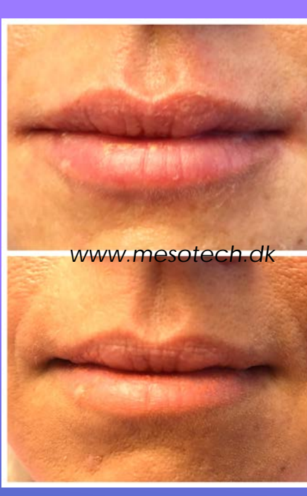
3 treatments (Without injections)