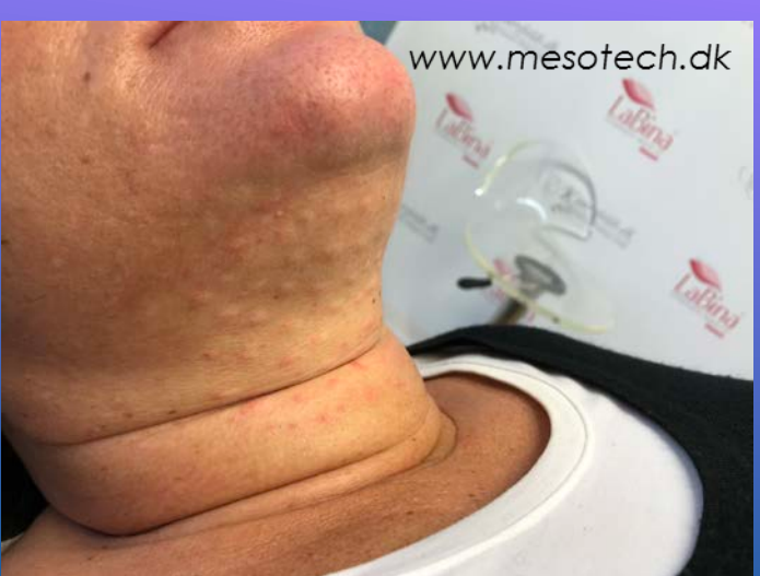
Example: Immediately after microinjections