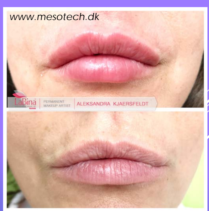
3 treatments (With injections)