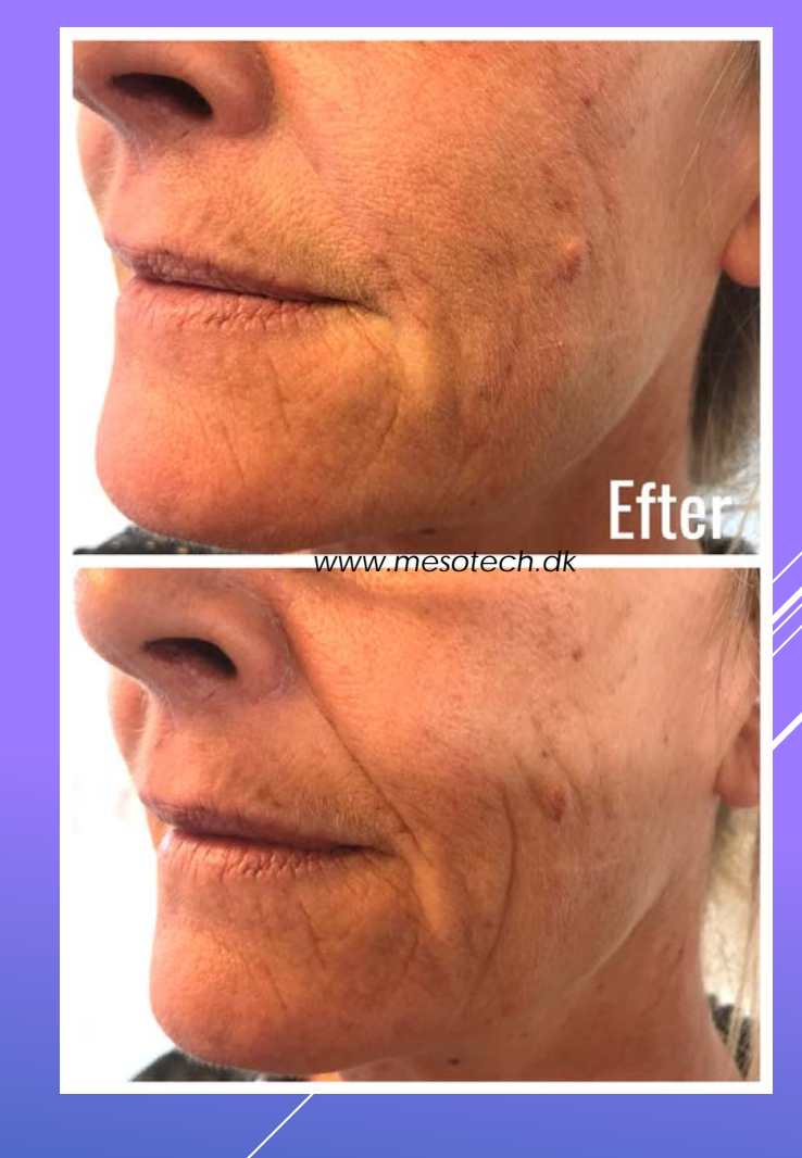
Result after 4 treatments with Hydralift:

2 treatment noninvasive and 2 treatments invasive (12 days intervals)